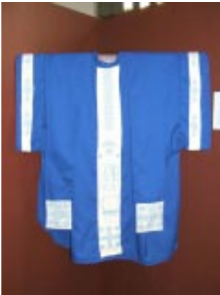
A chasuble, by Duane Bonds

tains a wide range of amazing art, much of it done by parishioners. Stop by and spend some time!