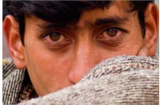
During the October, 2005 Pakistan earthquake, this teenager's village in northern Pakistan was badly damaged.

The West has responded that there’s little they can do about the cartoons, citing freedom of the press and free speech. However, many Muslims say there’s a double standard when it comes to free speech. For example, some Muslims have noted that in some European countries it is against the law (and therefore not permissible under “free